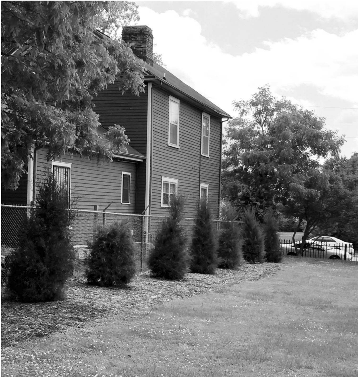
Eastern perimeter-After landscaping installation, facing southeast