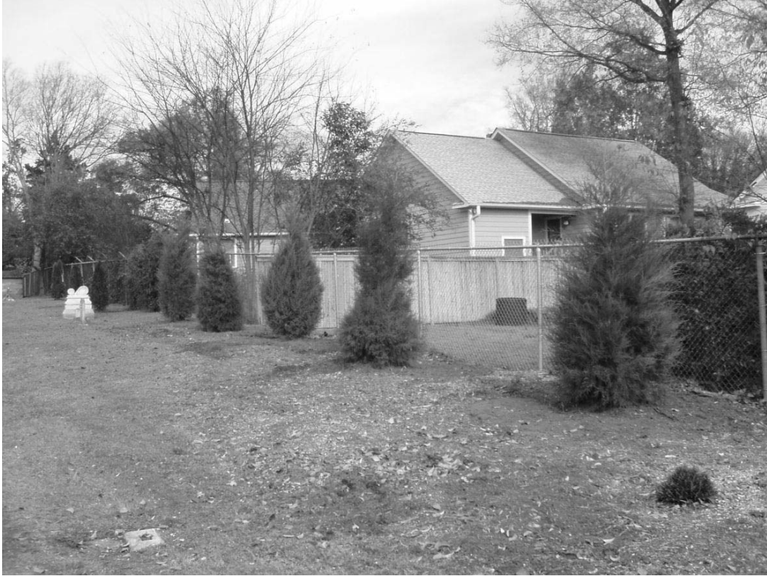
Eastern perimeter-After landscaping installation, facing east-northeast

Per the adopted Landscape Plan, a section of non-historic fencing near Fire Station #3 (along the northern cemetery boundary adjacent to the fire station and parking lot and a short section along New Bern Avenue) was replaced in winter 2016.