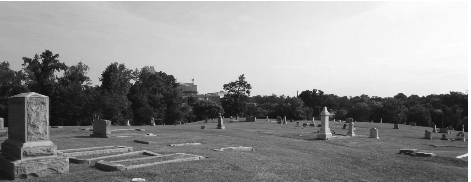
Mount Hope Cemetery