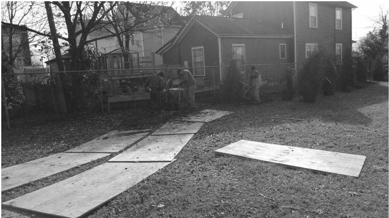
Eastern perimeter- during installation